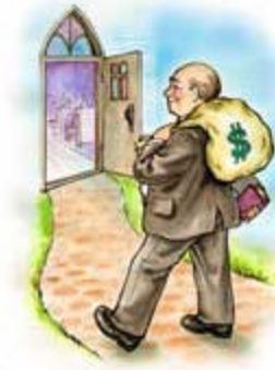
The gender of the character portrayed does not limit this gift, or any gift, to any particular gender.

As a giver you probably feel that the best way you can give of yourself is to give of your material gain for the work of God. You give without public recognition and usually do not want people to know who you are nor how much is given. You disapprove of anyone who gives for the wrong motive. Your motive is to further the work of God and meet real needs, not to show off or get something in return.