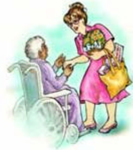
The gender of the character portrayed does not limit this gift, or any gift, to any particular gender.

The Greek word "e \lambda lco" means to feel sympathy with or for others. As a mercy-shower you have the Spirit-given capacity and desire to serve God by identifying with and comforting those who are in distress. You understand and comfort your fellow Christian. You enter into the grief or happiness of others and have the ability to show empathy which is to feel WITH others, not just for others.