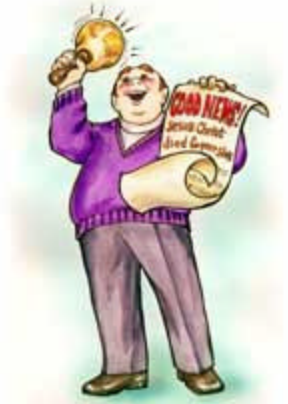
The gender of the character portrayed does not limit this gift, or any gift, to any particular gender.

That does not necessarily mean you are supposed to travel the world, preaching the Gospel. The Greek word " Euangelistes " means to proclaim glad tidings, a messenger of good. It denotes a proclaimer of the Gospel. The evangelist can either be a preacher who stands before a crowd, imploring people to be saved, or perhaps an individual sitting in a living room or on a plane, trying to help people understand what a relationship with Jesus is all about. As an evangelist you have the Spirit-given capacity and desire to serve God by leading people who are beyond your natural sphere of influence toward faith in Jesus Christ.