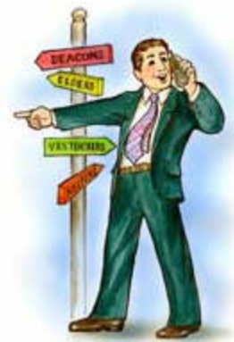
The gender of the character portrayed does not limit this gift, or any gift, to any particular gender.

HOW CAN YOU USE THIS GIFT? You may work well as the leader of a project, ministry, or program; chairman of a committee or board; a church planner; or chairman of building or fund-raising projects. Other positions where you may serve well include pastor, assistant pastor, business manager, office manager or department head for large staff, Sunday school superintendent, fellowship group or missionary group leader, library manager, camp director, church moderator, bus ministry director, nursery coordinator or Vacation Bible School director.